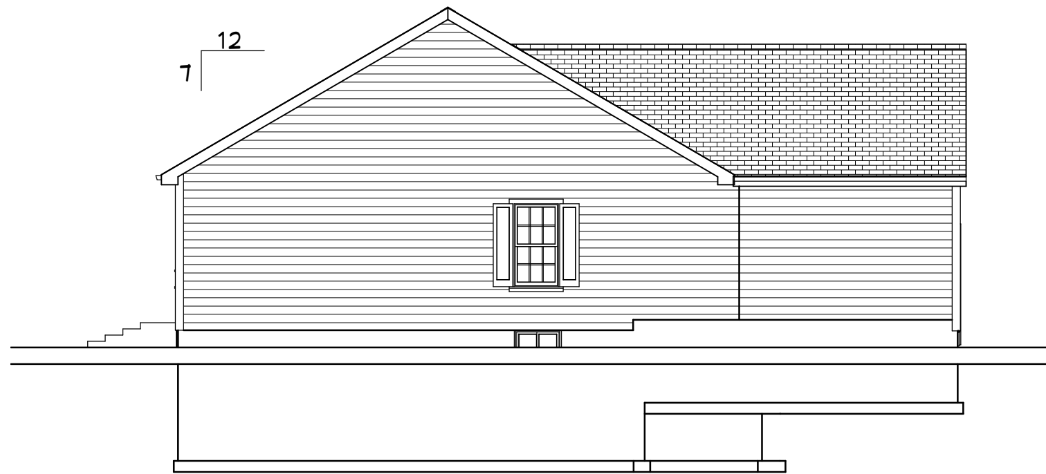
LEFT ELEVATION 1/8"=1'0"