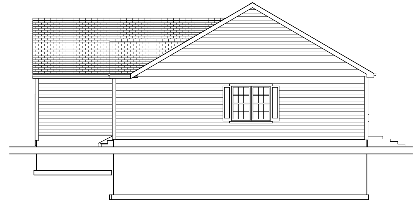
RIGHT ELEVATION 1/8"=1'0"