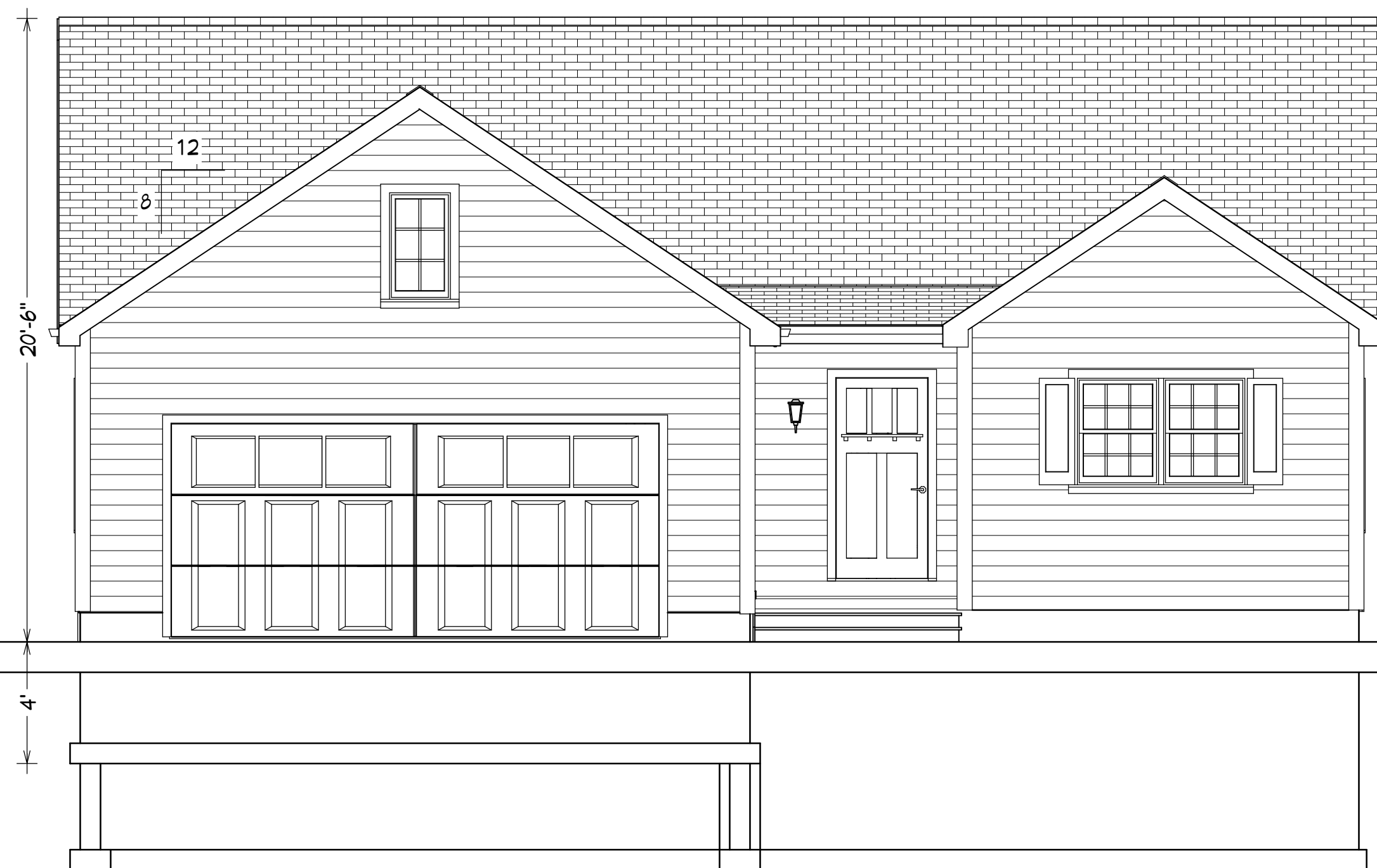
FRONT ELEVATION 1/4"=1'0"