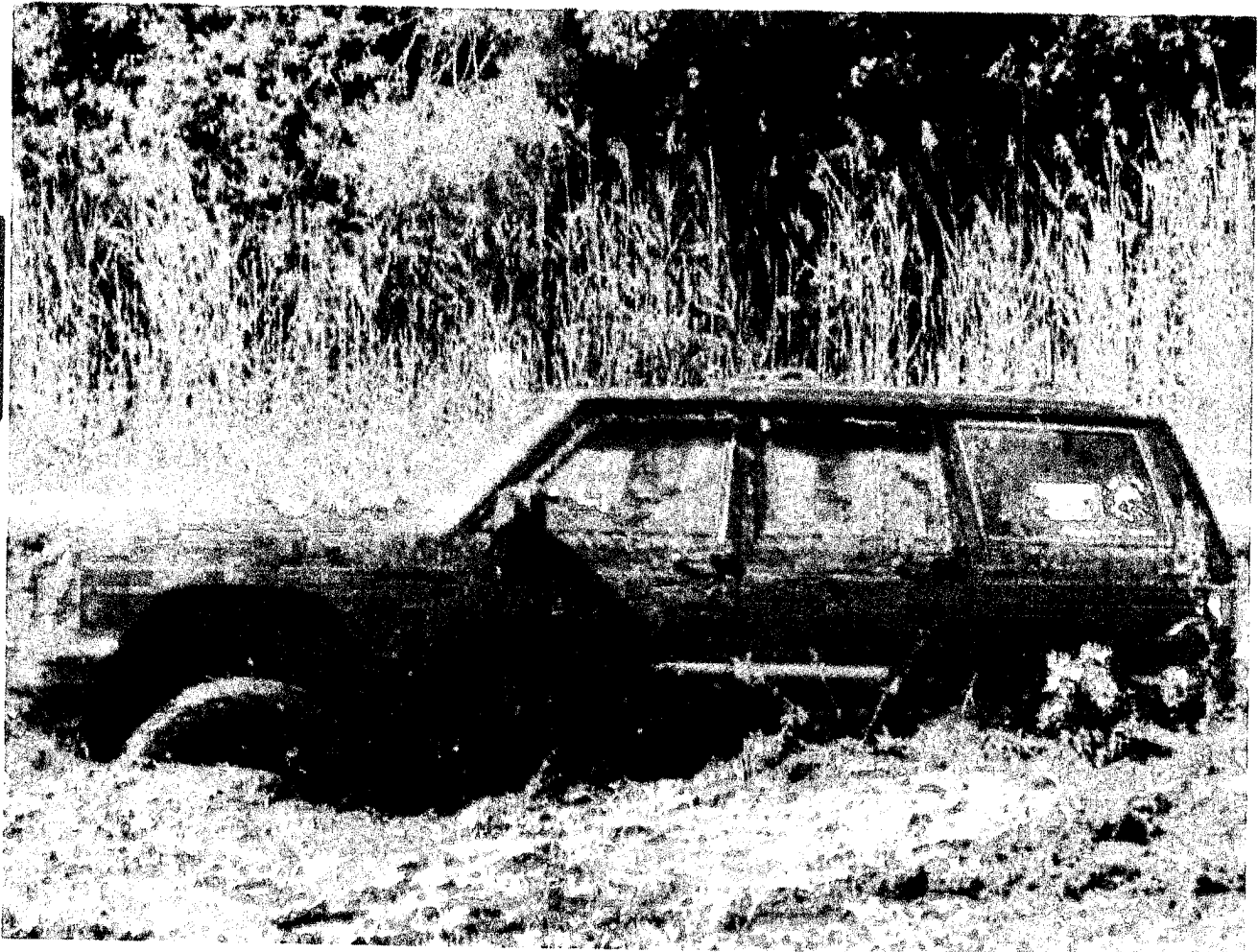
Drivers braved the mud bog for bragging rights of getting through and out the other end.

But most drivers were undeterred - getting stuck in the mud only creates an incentive to try, try, again.