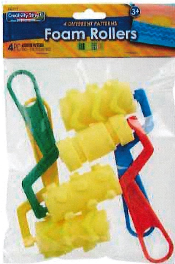
Recalled Creativity Street Foam Pattern Rollers in packaging