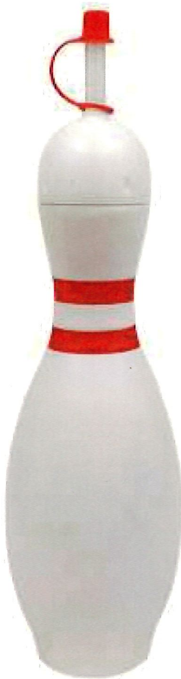
Recalled Bowling Pin Sipper Cup