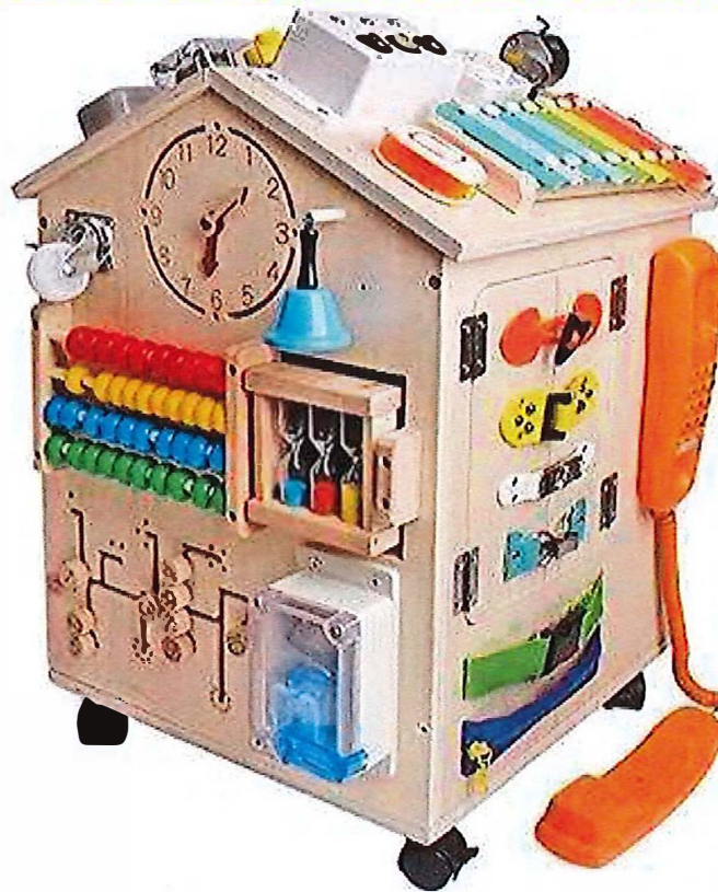
Recalled Tangame busy house