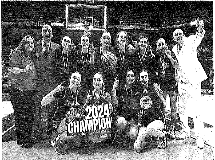
Somers players and coaches celebrate their victory Sunday over Thomaston in the CIAC Girls Class L Championship at the Mohegan Sun Arena.

The players and coaches were still laughing about the suits when they walked under the stands of the arena back to board their bus home. This time while carrying their medals and championship plaque.